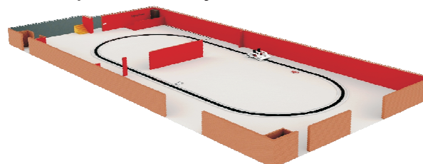
Routing of drive testing plant