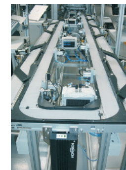
Internal transport system

As far as internal transport systems, such as in productronics as well as food and pharmaceutical industry are concerned, further fields of application open up for the industry due to the bearing being free from wear and abrasion.