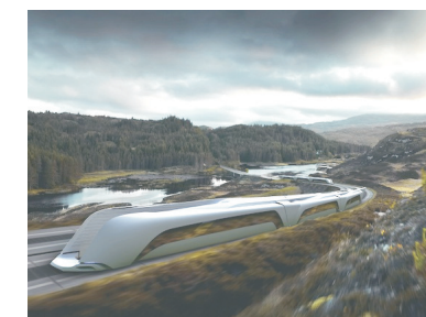
Concept study / TU Dresden